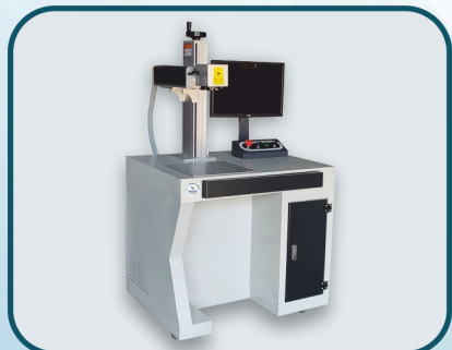
Metal Marking Machine