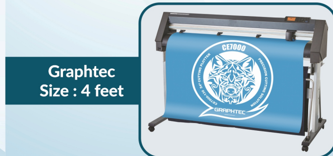
Graphtec Size : 4 feet