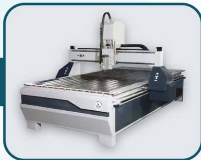
CNC Machine Size - 4 x 8 Feet