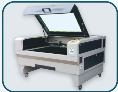
Laser Machine Size - 4 x 3 Feet 100 watt