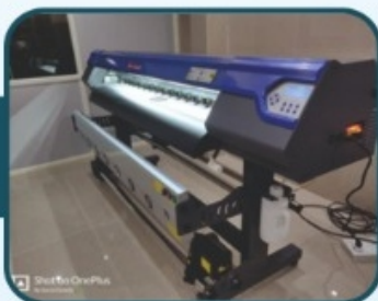
Eco Solvent Machine Size : 5 Feet

All Cutting Plotter And Lamination Machine