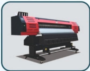
Solvent Machine Size : 10 Feet